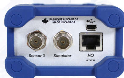
PD Annunciator™ USB connector allows data transfer