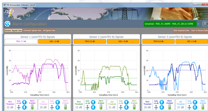
PD Annunciator™ Software

The PD Annunciator™ software is used to set alarm threshold for each acoustic and TEV channel. It allows displaying graphics representation of the partial discharge activity on a user friendly intuitive interface. The PD Annunciator™ software is used to retrieve data from the PD Annunciator's™ USB port where 15 000 entries are saved.