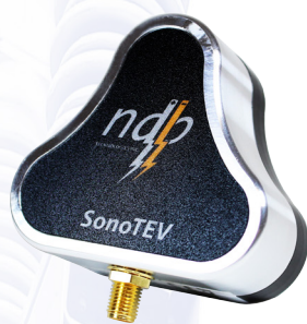
SonoTEV™ TEV and contact acoustic sensor

The SonoTEV™ sensor is installed directly on the cabinet metallic surface. It detects VHF signals produced by partial discharge activity within the cabinet system using a capacitive coupling technology. The SonoTEV™ sensor is also equipped with a contact ultrasonic sensor that targets acoustic PD signals. The flexible SonoTEV™ is equipped with an airborne acoustic sensor mounted on a flexible arm. Its unique flexible arm design allows an infinite adjustment of the probe's orientation.