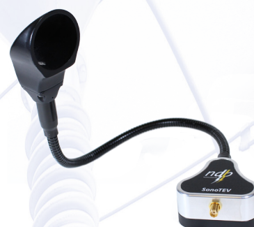
SonoTEV™ TEV and airborne acoustic sensor