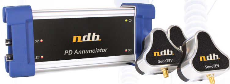
PD Annunciator™ system

The PD Annunciator™ module is equipped with a fast VHF PD detection circuit for TEV detection. It also has a highly sensitive ultrasonic detection circuit for optimal results. Software algorithms are used to discriminate partial discharge from ambient noise. Multiple PD Annunciator™ modules can be used daisy-chained thus enabling PD detection on many cabinets at the same time. Standard Ethernet cables are used for data transmission and power supply.